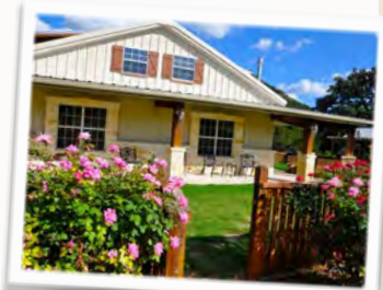
The Villa at Polvadeau Vineyards provides a luxury accommodation for your wedding night

For ceremonies Monday-Thursday $2,500 For ceremonies Friday-Sunday $3,000