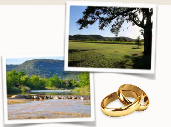
Lush green vines, shady oak trees and crystal clear waters will serve as the backdrop for your wedding.